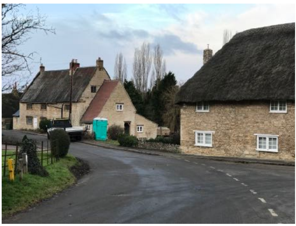
No 14 Combrook with new side and rear extension nearing completion